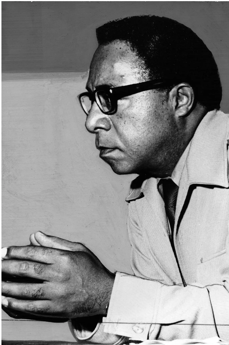
Alex Haley in 1977. He spoke with the easy grace of a country parson, but no fire and brimstone emanated from his pulpit.

I first realized what a compelling raconteur Haley was during a lecture on his work in progress that he delivered in Hamilton's chapel during the fall of 1968. He enraptured that room of diffident white college men with his tales of the 18th-century African named Kunta Kinte, whom his captors called Toby. He told us about Kizzy ("that means 'stay put'" in Mandinka) and Fiddler and Chicken George and the other characters who nearly a decade later would be known to all America. He spoke with the easy grace of a country parson, but no fire and brimstone emanated from his pulpit as he calmly but bracingly recounted what he said was his mother's family history. He did not shy away from describing the brutalities one race inflicted on another. The tradition at Hamilton at the time was to snap one's fingers in approval rather than to applaud; his lecture was received with thunderous snaps.