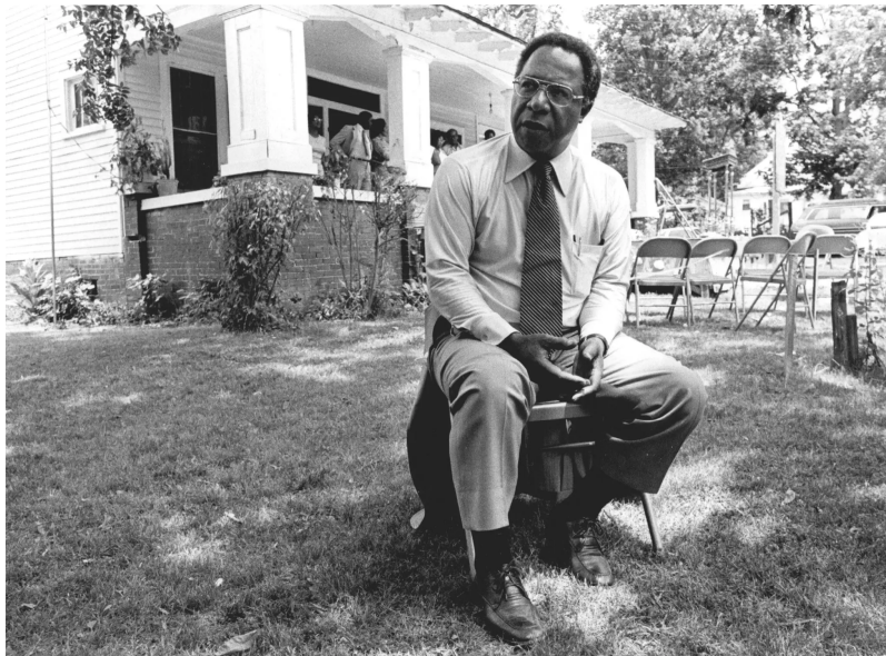
Alex Haley in front of his childhood home in Tennessee in 1977.

It may have been at this point that Haley's "nonfiction" book became a novel, though both author and publisher insisted that it was unadulterated truth. I heard a rumor that Doubleday had to lock Haley in a hotel room with the phone off the hook to get him to finish the manuscript. The air date of the mini-series was fast approaching. Haley's expenses included more than a half-million miles in flights and totaled around $80,000 — about $500,000 today. One night his writer's block was so intense that he contemplated jumping to his death off the freighter near Liberia, where he had gone to write.