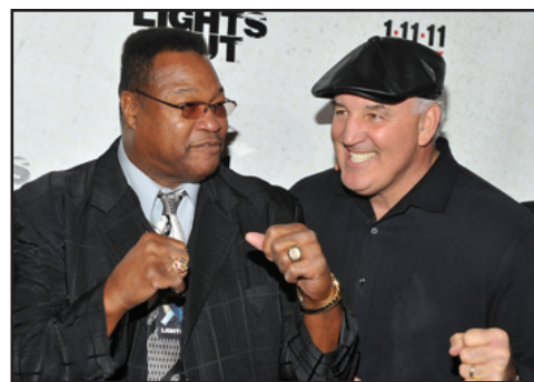
Larry Holmes and Gerry Cooney.